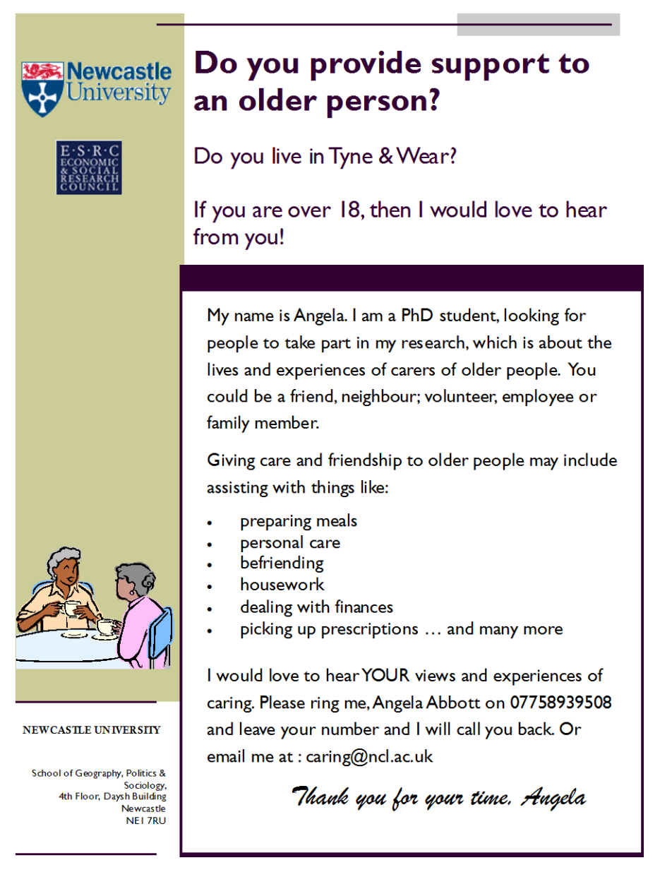
Figure 4: Recruitment poster and abbreviated leaflet. This was printed on yellow paper to assist readers with visual impairment.

visits so that I could discuss my research and distribute leaflets to their clients (Appendix D). Following a response, I either talked to an individual at the organisation, or gave a bundle of leaflets for them to pass on or leave on the premises; or if appropriate, I addressed groups directly on the organisation's premises, explaining my research and providing leaflets with my contact details. I had two leaflets — one a 3-way folded leaflet with a cut-out coupon to express interest if this was preferred to telephone or email; and an A5 leaflet, as shown below in Figure 4.