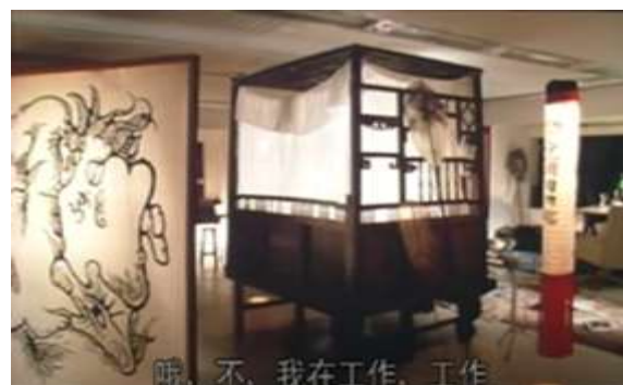
Figure 16 Blurred public/ private boundary: a bed in the studio