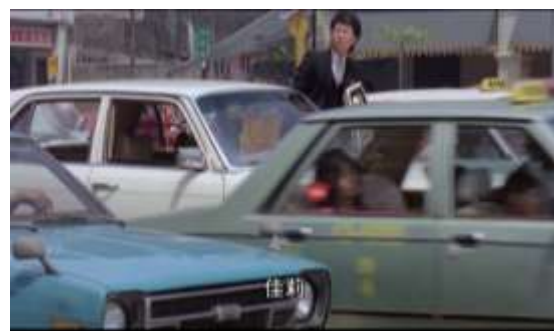
Figure 8 De-wei entrapped in urban space TDOTB (1983)