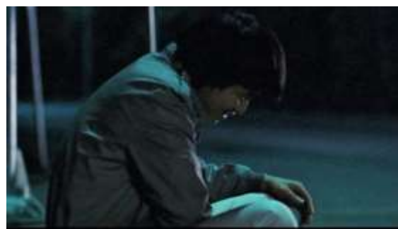
Figure 5 Bygone glory of the ex-LLB teammates TS(1985)