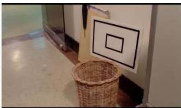
Figure 48 Improvised basketball hoop at the office TDOTB (1983)