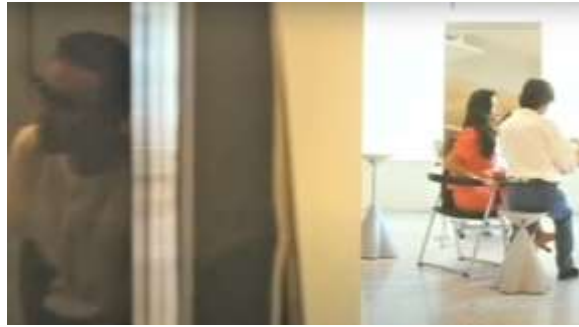
Figure 135 Hongkong's shady mirror reflection MJ (1996)