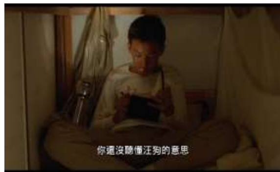
Figure 86 Japanese wardrobe: another cage motif ABSD (1991)