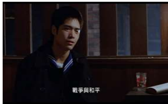
Figure 77 Honey's lonely figure framed by door ABSD (1991) Figure 78 Honey caged-in by wooden bars ABSD (1991)