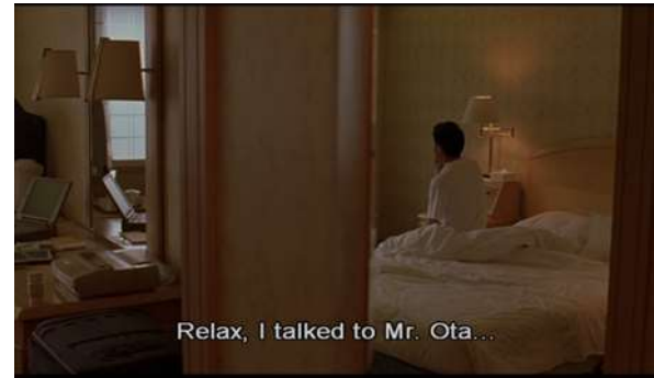
Figure 116 & Figure 117 NJ's lonely figure in different frames-within-frames devices Yi Yi (2000)

Though the meanings of masculinity vary across cultures, through history, among men within any one culture, and over the course of a man's life (Kimmel 1997:189), the toll taken on masculinity construction under the breakneck speed of modernisation compounded with global capitalism is, in Yang's films, universal. After NJ has left the company, Da-da confesses to NJ about his masculinity crisis: 'I've worked my butt off all these years, and I didn't do it for fun. You know, NJ, I'm never happy.' The experience of pressure, long working hours, high pay but low security induces mental and physical crises in transnational business masculinity, which in turn is shaped by the social, cultural and economic changes shifts that have been labelled globalisation. As globalisation seems to be an irresistible natural phenomenon in late modernity, there is simply nowhere for men to hide from these ordeals.