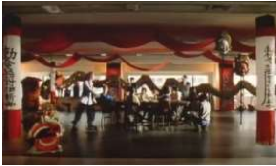
Figure 14 Birdy declaring his pseudo-Confucian views ACC (1994)