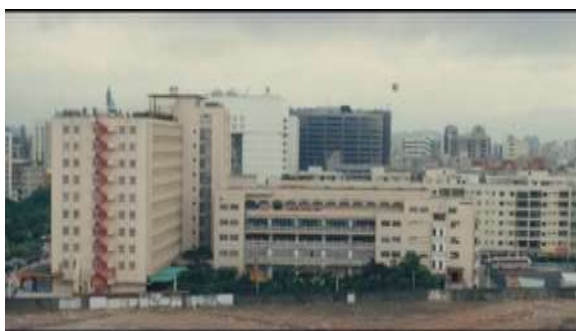
Figure 7 Which buildings are designed by Xiao-ke? TS (1985)

For example, in That Day on the Beach , the male protagonist De-wei is a stereotype of people who are lost when being confronted with a complex diversity of choices. As he explains to his childhood friend and business partner, he and his wife, Jia-li, have gradually grown apart because of the hectic life he is living and the endless risks he has to take in his work. De-wei seems to be imprisoned constantly in an enclosed area, be it in his home, workplace or car. Even when he is in an open space he seems to be ambushed and entrapped by the busy traffic (Fig 8), looking frustrated, nervous and exhausted. Apparently, the rapidly changing society has exhausted his means to keep up with that pace, while at the same time he is struggling to live up to the expectations of Jia-li to fulfil the role of a caring and understanding husband. Despite De-wei's efforts to fulfil the traditional role of the primary breadwinner and head of the household, his masculinity is in turmoil as he navigates this pressure.