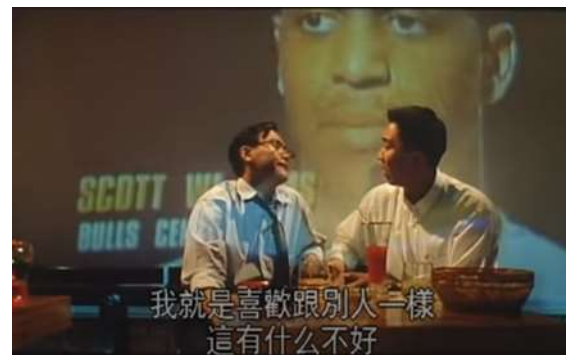
Figure 92 Chinese 'wen' masculinity vs American masculinity (1994)