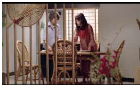
Figure 49 Wooden cage motif TDOTB (1983)