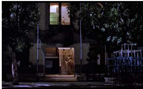
Figure 81 Long shots to frame violence ABSD (1991)