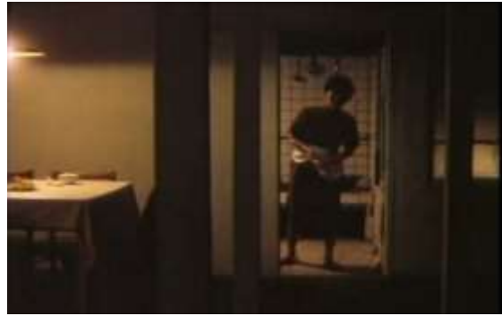
Figure 34 & Figure 35 Door frame showing the sense of confinement of the family's matriarch Expectations (1982)