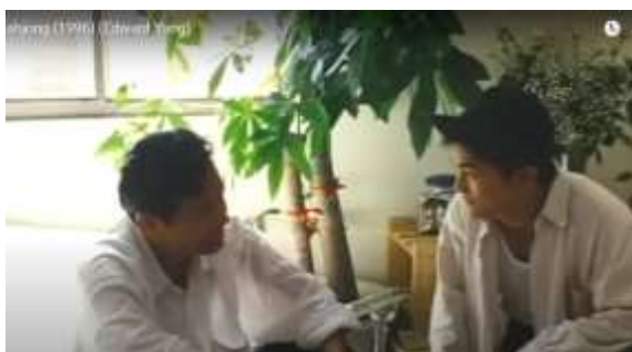
Figure 152 Figurative reflection of Hongyu & Mr Chen also reflects the father-son relationship in ACC MJ (1996)

In Mahjong , Hongyu's father Mr Chen goes into hiding after running into serious debt and only contacts his son before he commits suicide (Fig 152). As a figurative reflection of the father-son relationship in A Confucian Confusion , both Xiao-ming and Hongyu seek out an imaginary father figure to help define their own masculine identity. While Xiao-ming relies on a 4 th century BCE ideology to build his masculine self in the late 20 th century, Hongyu's benchmark for manhood is Mr Chen's fraudster identity. His ideal masculine image is, in his own words, 'the most shameless and successful swindler Mr Chen ten years ago', who manipulated and exploited people who did not really know what they wanted. In this light, the representation of the father-son masculinity also depicts the trajectory of Taiwan's modernisation process in late modernity. At the peak of global capitalism, the post-traditional and post-martial law Taiwan is filled with Western capitalists (epitomised by the French company Matra which built the Muzha MRT in Taipei at a ridiculously high price) and local money grabbers (exemplified by fraudsters like Mr Chen and his son Hongyu and his gang) who cannot wait to make instant profits. The blind pursuit of capital gains ends in serious disillusionment in Yang's postmodern men. As Mr Chen reflects when he last talks to his son,