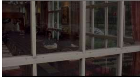
Figure 18 & Fig 19 Characters shot from the opposite side of the glass panes in cafes Yi Yi (2000)