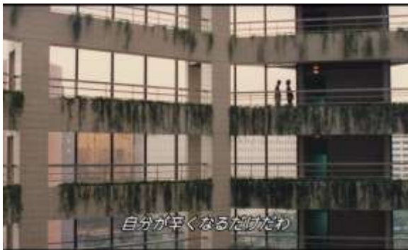
Figure 59 Office building featuring the grid motif TS (1985)