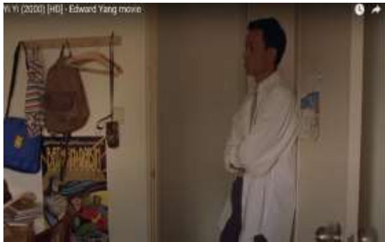
Figure 120 NJ: neither in nor out Yi Yi (2000)