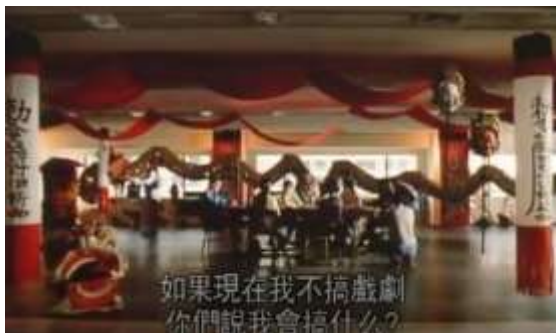
Figure 12 Brechtian style alienation effect ACC (1994)

同 Shijie Datong ) does not mean a utopian world in which everybody lives in peace and mutual respect, instead it means one in which ‘everybody thinks the same’. Drawing an analogy between democracy and his art, he claims that if democracy is about voting, box office performance is the most democratic voting system: box office success means great art. Here, as Yang emphasises in another interview (Chang & Li 2008: 51) and throughout the whole film, Confucian ethics which are likely to create confusion in times of great change are still being exploited as a kind of signposting to help. Though it is debatable whether Birdy truly believes in Confucian teachings, they are appropriated to justify his façade as a postmodernist avant-garde artist for financial gains. In this way, Yang exposes the danger of using an outdated ideology to deal with problems facing modern-day people in a quickly changing society.