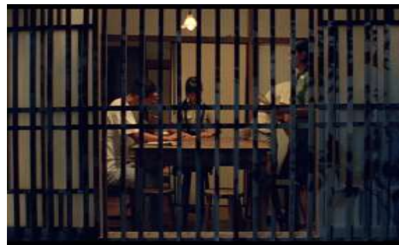
Figure 87 & Figure 88 Si'er's home is filled with rigid frames and divisions, highlighting a sense of alienation ABSD (1991)

Whether it is a means to assert masculinity or to fight against social injustice during the repressive dark era, Yang's reconstruction of the root cause of the teenage homicide incident recreates a cross-section of the history of that period. Released at an important turning point in Taiwan's history, ABSD looks backwards and also responds to sociopolitical needs in