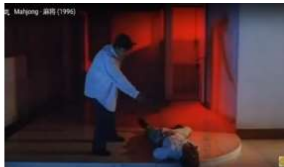
Figure 106 & Figure 107 Hongyu's frustration bursts into violence, framed by the walls and the raised platform MJ (1996)