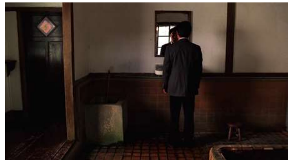
Figure 130 & Figure 131 Li introspecting about his displaced male identity Terrorizers (1986)

In the films made after Terrorizers , Yang once again minimises the use of specular reflections to inform male identities. In A Brighter Summer Day and A Confucian Confusion , there is only one mirror shot in each film that shows the male protagonist from the front. As previously shown in ABSD , the patriarchal institution of the Nationalist government incited brutal violence on Taiwanese people during the reign of the White Terror. In addition, the omnipresence of