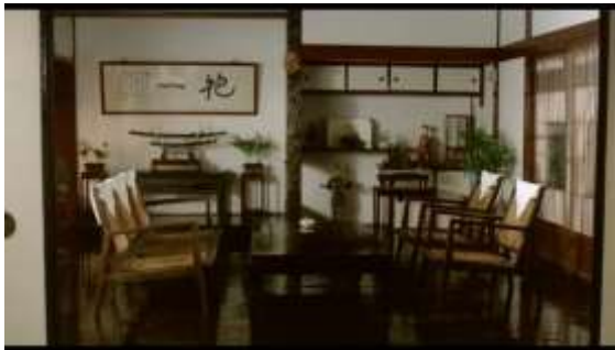
Figure 1 Japanese-style housing TDOTB (1983)

internationally acclaimed films as Days of Being Wild (1990) and In the Mood for Love (2000). According to Yang, some production crews assigned by CMPC would often refuse to take directions from him while he was making Expectations . He was therefore determined to use Doyle, and this supports film producer Jen Hong-zhi's claim that the TNC movement did not involve any major infrastructural changes.