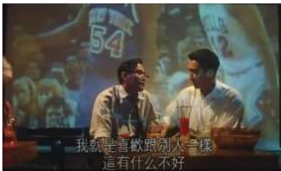
Figure 23 NBA players: American masculinity ACC (1994)

In addition, the neocolonial influence of global capitalism has a major impact on the subjectivity formation of Taiwanese men. The invasion of Western culture, which in the case of Taiwan is mainly American, has cast a cultural castration effect on Taiwanese masculinity. For example, in A Confucian Confusion , the image of the male protagonist Xiao-ming and his colleague ‘relaxing’ in a sports bar aptly explains the challenges faced by Taiwanese men. The huge projected image of NBA players (Fig 23), a representation of American masculinity, dwarfs the two men, thereby suggesting that they need to keep up with the rapid pace of modernisation and intense global competition to protect their vested interests. Similarly, in Mahjong , the American restaurant chain Hard Rock Café is a place where men go to flaunt their trendiness or their transnationality, and trendiness is perceived as being a Westerner or speaking with an impeccable American accent. Without a foreign racial status or an ability to cash in on Western cultural capital, the local gang led by Hongyu appears to be small-time crooks who are out of place in the rapidly globalised and internationalised Taiwan.