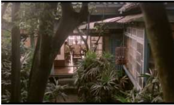
Figure 41 Frames-within-frames showing home as a prison TDOB (1983)

The death of the father marks the end of an era. To Jia-sen, however, this is not the solution to his problems. As he stated to Jia-li in the film,