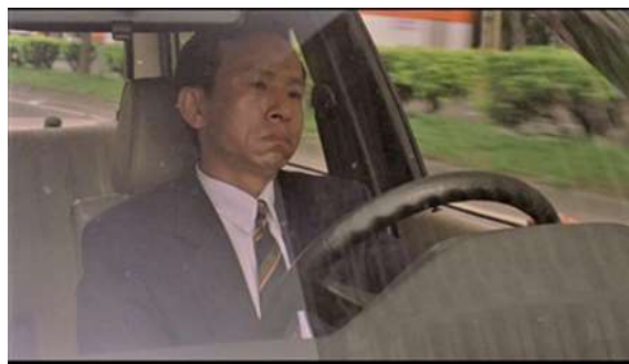
Figure 140 & Fig 141 Reflections of skyscrapers signifying ubiquitous anxiety and uncertainty Yi Yi (2000)