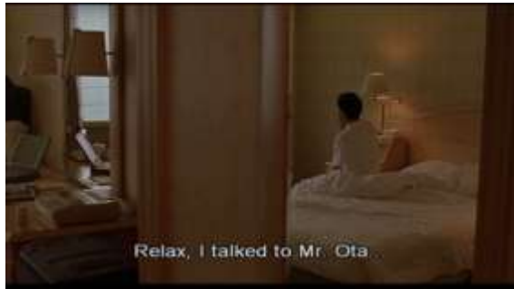
Figure 137 NJ learns about his colleagues' betrayal Yi Yi (2000)