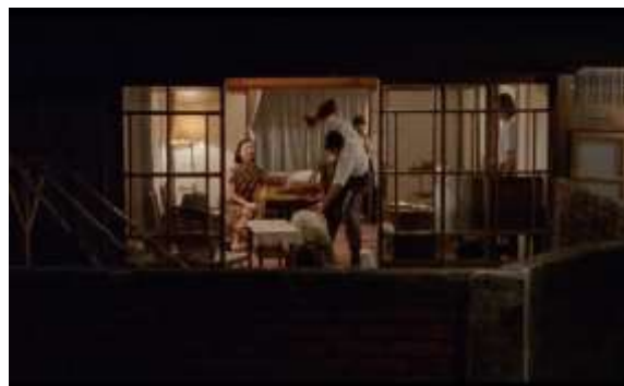
Figure 75 Zhang looks helpless by the framed windows Figure 76 The caged-in father venting his frustration ABSD (1991)

In Susan Jeffords' study of muscular heroes with 'hard bodies' in 1980s Hollywood cinema, she associates cinematic images with political crisis and national identity. According to Jeffords,