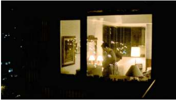
Figure 139 NJ and Min-min engulfed by existential angst in the city Yi Yi (2000)

Another function of Yang's glass reflections is to highlight his concerns with subjectivity, alienation and fragmentation in a transnational cinematic space situated in the wider context of the highly globalised reflexive modernity. As Chang observes, permeable and liquid omnipresent glass panes in Yang's films act as an interface for the projection of fragmented and ambiguous personal identities, which are blurred and darkened by the complex webbed relationships as well as a series of fakeries, frauds, betrayals, violence and exploitation in disguise (2019: 21). As Jacobson contends, Yang's glass reflections suggest human alienation and objectification in an urban environment (2005: 52). While the angst of different city dwellers is projected on the glass interface simultaneously, this invisible divider reminds the spectators that these people are separated and cornered in their own world. The invisible but ubiquitous suppression and repression of anxiety and uncertainty imposed on the urbanites is reified as the reflections of the skyscrapers rolling over and engulfing NJ and his business partners (Fig 140 & 141).