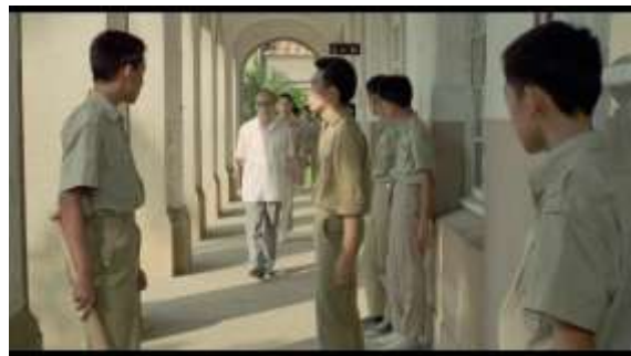
Figure 28 & Figure 29 Tunnel vision has strong institutional links with orderly corridors found in official settings. ABSD (1991)