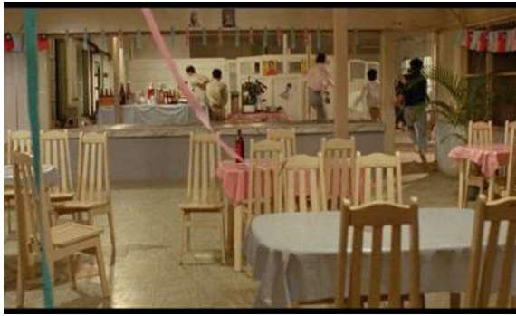
Figure 84 Violence in ice-cream parlour ABSD (1991)

Unlike other gang members in the film, however, Si'er does not possess a clear identity as a gangster. Honey and the local Wanhua (萬華) gang do not know his name; the head officer of the Juvenile Division has not seen him before, mistaking his signature as a 'funny face' (Fig 85) after he is arrested. Indeed, he is a marginalised character with only an ambiguous identity even within the gangster world that he joined to assert his identity. This sense of disillusionment and ambiguity is also illustrated in his living environment, with a strong sense of entrapment and frustration highlighted by Yang's frames-within-frames devices. The Japanese-style housing in which his family live is in the first place a symbol of these mainlanders' displaced and confused identity. As Si'er's mother notes with a hint of sarcasm, having fought the Japanese for eight years, they now live in Japanese houses and listen to Japanese songs.