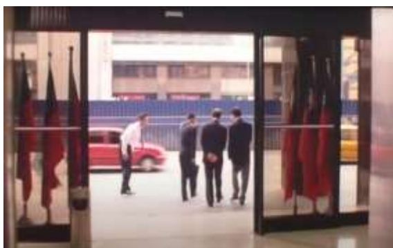
Figure 93 Xiao-ming's humility shown in frame ACC (1994)