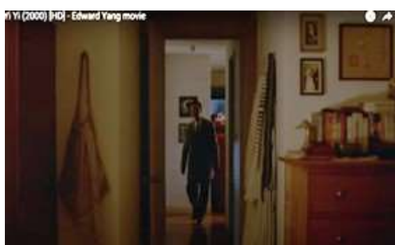
Figure 119 NJ as half outsider in his family Yi Yi (2000)