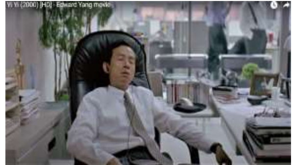
Figure 115 Nj in his own world Yi Yi (2000)