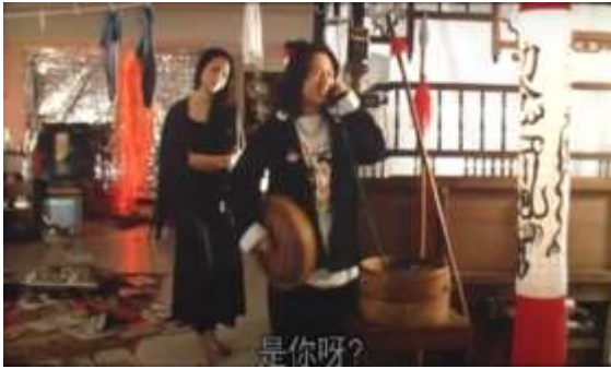
Figure 17 Blurred public/ private boundary: a telephone in a stage prop ACC (1994)

Similarly in A Confucian Confusion , the spatial ambiguity in Birdy's working and living spaces also manifests a loss of control of his privacy and the lack of protection of his true (yet also fake) identity. Comparable to Deleuze's concept of 'any space whatsoever' as discussed at the beginning of this chapter, Birdy's studio/ living space does not give him any sense of belonging. It does not feel like his home as his personal space is constantly intruded upon and his furniture and household utensils are props. Yang's construction of such a space with an undetermined nature exposes Birdy's identity crisis: his messy and fake living space is a manifestation of his hypocritical character and his fake identity as a master of postmodern art and as a spiritual guru of the modern-day people.