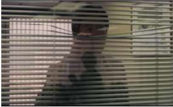
Figure 57 Xiao-ke's office as the prison motif TS (1985)

of other smaller companies are also in a way boxed in by the entrapping, bureaucratic nature of modern capitalism. Also, the empty corridors and big glass panels of the building feature the grid motif (Fig 59), while Yang's extreme long shots manifest alienation and the diminished sense of self against a cityscape filled with glassy and homogenous blocks of offices.