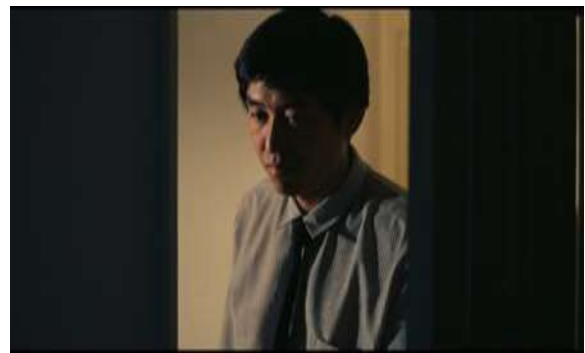
Figure 60 Matchbox-like buildings evoking the cage motif TS (1985) Figure 61 Xiao-k's trapped masculinity TS (1985)

As stated in the above analysis, not all men benefit from modernity and globalisation. Men may enjoy systemic patriarchal dividends but on a personal level, some men do suffer, and their sufferings do have undesirable impacts on their masculinity formation. Though Jia-sen and Ah-liong both inherit patriarchal dividends from their fathers which has a strong connotation of the colonial bygone glory, they suffer because they are imprisoned by the residual glories of a bygone era and fail to meet up with the changing masculine expectations in modern society. While De-wei and Xiao-ke seem to be privileged young professional urbanites, their masculinities also suffer as they find it difficult to adjust to the rapidly changing social, economic and cultural transformations. In any case, through the use of frames-within-frames, Yang's initial works delve into the themes of absent father figures and weakening patriarchal role models, serving as a powerful depiction of Taiwanese masculinity and its evolution in tandem with the progressive shifts of Taiwanese society. In the next film Yang produced shortly after Taipei Story , it seems that the breakneck speed of economic development and the corresponding consequences of modernity have in many ways exacerbated the identity crises facing Taiwanese men, which Yang continuously manifests in his use of frames-within-frames devices.