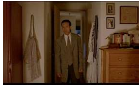
Figure 121 NJ always enclosed by some sort of frames Yi Yi (2000)

As Yang highlights through the characterisation of NJ, while the hegemonic facet of transnational business masculinity strengthens the gender division of labour within households in a global arena, it is not necessarily the only path of masculinity building in the rapidly modernising Taipei. As briefly discussed in Chapter 2, despite Giddens's suggestion that modernised societies see an increasing self-monitoring capacity among the agents in their identity construction (Giddens 1991: 75), this greater reflexivity does not inevitably lead to detraditionalisation. In fact, as much as tradition is something gradually dis-embedding and being un-done in late modernity, gendered reflexivity can also contribute to the continuation of certain traditional values (Chen & Mac an Ghail 2017: 52). Yang's representation of NJ's masculinity seems to resonate with this argument, echoing the meaning of the film's Chinese title, '— —', which bears the meaning of going back to the beginning for a new start.