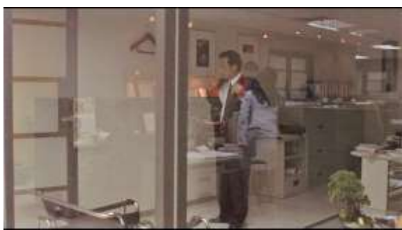
Figure 142 Glass reflection highlighting NJ's fragmented and complex self Yi Yi (2000)

Struggling to position their company in the changing media landscape, NJ and his business partners fall into deep disagreement. While his short-sighted business partners try to assign NJ the role of wooing Ota and keeping him interested in the business deal, NJ is resentful of their dishonest tactics that put profit before ethics, a defining quality of transnational business masculinity (Connell & Wood 2005: 361). As NJ tries to define his own masculinity in the post-traditional settings which emerge from modernity's dynamism, his fragmented subjectivity is highlighted in Yang's glass reflection. In the scene when NJ learns that his business partners are going to strike a deal with the copycat company Ato, there is a static image projected on the huge glass pane showing the overlapping bodies of his secretary, another office worker and himself, highlighting the fragmentation of his complex self (Fig 142).