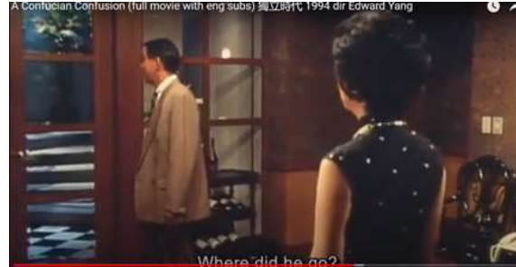
Fig 150 & Fig 151 Figurative reflection of Xiao-ming and father highlights the absence of patriarchal figures ACC (1994)

The rapidly detraditionalising society causes confusion not only in Xiao-ming's perception of human relationships, but also in his deep-rooted reference to the Confucian teachings as the foundation of his masculine identity formation. In fact, the Confucian ideology which stresses rigid vertical and one-sided human relationships, where individuals are subsumed under patriarchal heads and women are submissive to their husbands, is hardly compatible with the ephemeral late modernity. While in the 1960s and early 1970s, Taiwanese women lacked wealth, power, and status in the labour market and the political sphere, women in the 1990s were more independent. Women like Molly and Qiqi are 'reflexive beings' whose constant reflexivity prevents them from simply submitting to the supposed head of the family, hence challenging the status of the patriarchal system. No matter whether it is the collapsing ideological patriarchal figure or the weakened patriarchal figure in disintegrating social ties, Yang's diegetic absent father figures highlight new Taiwanese men's struggles across generations under an authoritarian political system or an overpowering economic totality compounded with global capitalism (Yeh & Davis 2005: 251). This kind of struggle is reflected in the figurative reflection of the father-son relationship between Hongyu and Mr Chen as well.