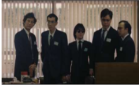
Figure 58 Men in suits and glasses lack distinctive identity TS (1985)