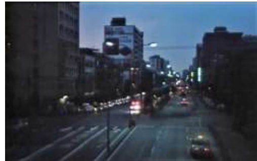
Figure 26 Tunnel vision foregrounding death TS (1985) Figure 27 Neverending troubles in urban settings Terrorizers (1986)

Yang's use of the tunnel vision technique to construct cinematic space culminates in ABSD , highlighting the film's status as a cinematic time tunnel linking the two Taipei Trilogies. ABSD , Yang's first post-martial law film, is set in the backdrop of the White Terror and examines how the politically repressive period shapes the frustrated masculinity of the gangster characters and manifests their constant struggle for secure personal, cultural and national identities. The film tells how the first and second generations of the so-called mainlanders — those who came from mainland China with the Kuomintang in 1949 — engage in power and sexual games, and how they try to adapt to the new social environment in Taiwan. The protagonist, Si'r, is a senior high school student. He participates in gang activities because his parents are burdened by responsibilities, inconsiderate, and often unjust, and because his girl betrays him. Ming, Si'r's girlfriend, lost her father in the civil war in mainland China. She and her mother, who suffers badly from asthma, depend on unwilling relatives, who are themselves destitute exiles from mainland China. Ming's mother is hired as a housemaid for the parents of Si'r's best friend, Ma. Lured financially and sexually, Ming falls for Ma and thus upsets the boys' friendship.