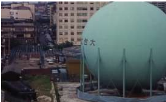
Figure 11 The big gas tank and the risk-ridden urban space Terrorizers (1986)

In a nutshell, Yang's construction of colonial and rapidly modernising urban space, be it private or public, highlights the social relations embodied and shaped in it. Through the construction of the obsolete, disappearing colonial space and the rapidly changing urban space which erases historical and personal identities, Yang represents the frustrated and entrapped facets of masculine identity which shape and are shaped by such cinematic space. The First Taipei Trilogy is thus a prime illustration of Lefebvre's assertion that space is a historical and social product. It also responds to Lefebvre's claim that abstract conceived space in modern society is prioritised over the perceived and lived space, as the former is constructed to serve