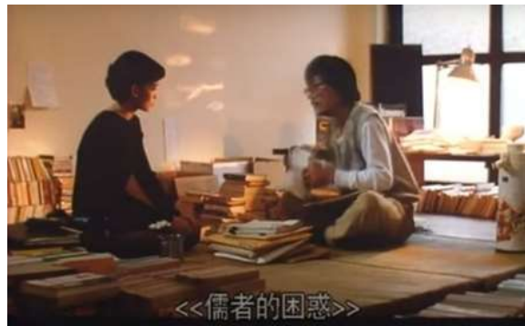
Figure 99 The author enclosed in his world of books ACC (1994)