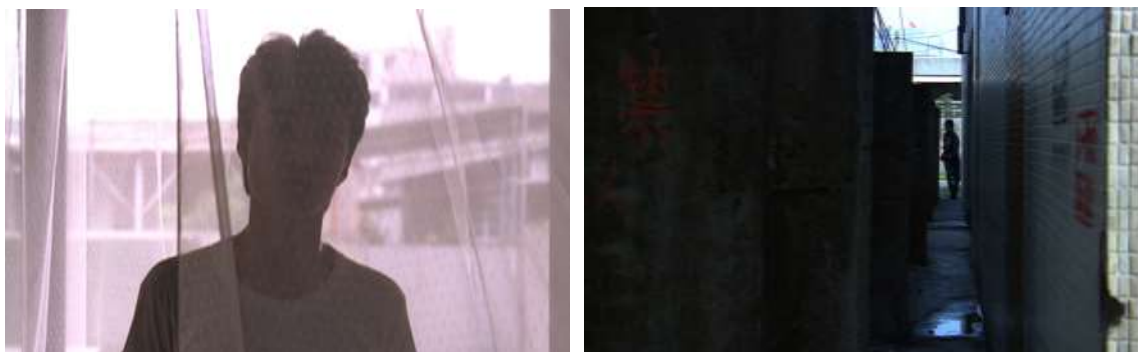
Figure 69 Silhouette suggesting uncertainty Terrorizers (1986) Fig 70 Tight alleys indicating trapped status Terrorizers (1986)