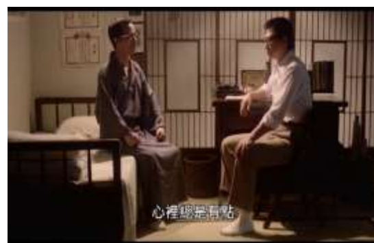
Fig 39 & 40 The Japanese house and the Japanese way of dressing symbolise authoritative patriarchal power TDOTB (1983)