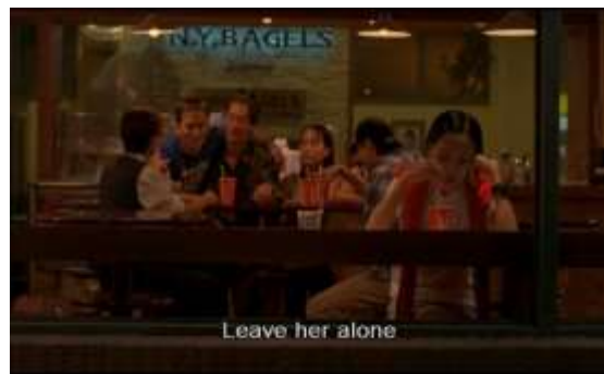
Figure 21 ACC (1994) & Figure 22 Yi Yi (2000) Homogeneous spaces such as international restaurant chains