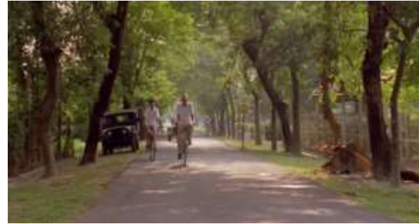
Figure 145 & Figure 146 Father and son figurative reflection through tunnel vision ABSD (1991)

In Mr Zhang's case, he tries to define his own masculine identity by standing up for his beliefs. In a scene featuring the figurative reflection of him and Si'er (Fig 147), he explains to the latter that, 'a man who lacks faith in his own beliefs is like a man without his scrotum', drawing an analogy between his masculine ideal and the male reproductive organ. This scene is yet again another reflection of a later scene after Mr Zhang's gruesome interrogation at the Garrison Command, only that it shows a voiceless and defeated father figure of Mr Zhang (Fig 148). As a kind of figurative reflection, this time it is Si'er who repeats Mr Zhang's proud motto, reassuring his father that he still believes their future can be changed with hard work and principles. The disillusioned and frustrated image of Mr Zhang denotes a psychological castration after he fails to uphold his own principles during the interrogation, owing up to