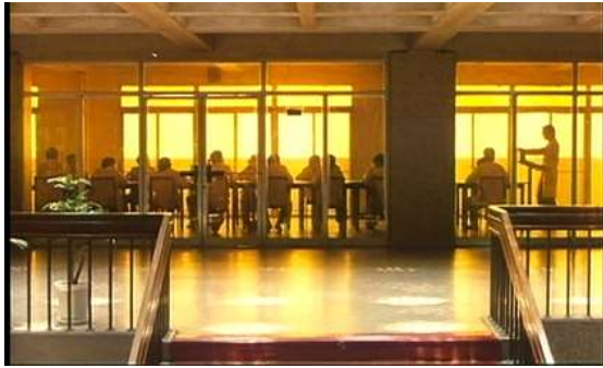
Figure 9 Li's alienating work space Terrorizers (1986)

rapid modernisation process, but Li also signalises Taiwan's situation in the international system (Jameson 1992: 145). Being economically successful and politically isolated and marginalised, Taiwan's frustrated and embarrassing position on the international stage is represented through the suffocating and frustrating life led by Li in Terrorizers .