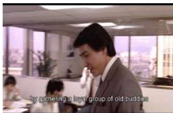
Figure 42 & Figure 43 Large windows and glass doors compartmentalising people in De-wei's working space TDOTB (1983)