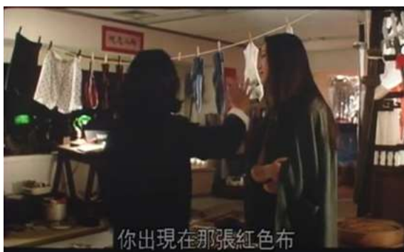
Figure 15 Birdy's studio-living space ACC (1994)

Take the studio-living space of Birdy, again, for example; the blurring of public and private boundaries is illustrated by the fact that this is a place where Birdy makes films and lives. His socks and underwear are hung near a bed in the studio (Fig 15, 16), where he tries to woo Larry's lover into sex. His telephone is hidden in a food steamer (Fig 17), making it difficult to distinguish whether the steamer is really a kitchen utensil for Birdy or a prop. The lack of clear boundaries between Birdy's public (the film set) and private (his bedroom) realms shows the vulnerability of city dwellers living with a porous public/ private boundary in urban city settings. These ambiguous urban spaces, as depicted in Tsai Ming-liang's Vive l'amour (1994), fail to provide city dwellers with any sense of identity and stability, and the reappropriation of public spaces for intimate behaviour only debases emotion in urban settings (Braester 2005:165). Thus Tsai's construction of cinematic space shows a disorientation highly associated with the collapsing societal structures in late modernity.