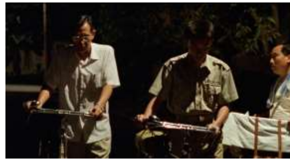
Figure 147 & Figure 148 Figurative reflection of father and son before and after Zhang's interrogation ABSJ (1991)

Si'er, as a figurative reflection of his father, experiences ambivalent identity issues stemming from the repressive and chaotic social environment. Although both he and his friend Xiao-ma are marginalised by the bureaucratic and patriarchal school authority, Xiao-ma uses his father's power to challenge institutional oppression while the powerless Si'er submits to the injustice and is silenced by the institution. This silence, however, is just a reflection of the outward conformity and inner rage of Jia-sen in That Day on the Beach , and the brutal violence hidden behind the voiceless younger generation epitomised by Ah-liong's murderer in Taipei Story . The inner rage turns into violence after Si'er's failed pursuit of Xiao-ming, the object of desire in a macho game of power. Xiao-ming, in a way, is a female figurative mirror of Si'er, as they are both searching for security. If Si'er builds his masculinity upon gangster identity, Xiao-ming builds her femininity upon men's jealousy and protection. Her fragility becomes the exact opposite of the masculinity evidenced in men, and in this way, she becomes a mystery in the eyes of men. (Liu 2004: 286). She is the symbol of patriarchal power and territory. The fruitless fight for the same woman among these young gangsters is not an act of love. Rather, it reveals the desperate need of these confused young men to define their own masculinity.