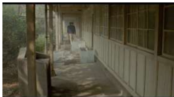
Figure 32 & Figure 33 Tunnel vision signifying the repressed and frustrated masculinity of Mr Zhang ABSD (1991)

In fact, this is an important turning point in the plot. Si'er is extremely disappointed in his father's change from a man of strict principle (he has a heart-to-heart conversation with Si'er