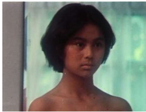
Figure 122 Mirror reflects true identity Expectations (1982) Figure 123 Mirror reflects changing identity Expectations (1982)