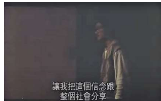
Figure 101 The author engulfed by darkness ACC (1994)

Note that Yang does not wholly disregard Confucianism, nor is he hinting that Western ideologies are the only way out of the crisis facing Taiwanese men in their construction of masculinity at the time. What Yang suggests is during the rapid transition into modernity, modern society is characterised by its ephemerality and reflexiveness. The prevailing hierarchical and patriarchal human relationships are therefore persistently being challenged and questioned, including the one-sided top-down bonds that uphold patriarchal power. The traditional principles and virtues appropriated by Chiang Kai-shek during the CCRM to emphasise self-cultivation on patriotism and filiality are observed only superficially, and even this superficiality is being challenged by the new social structures enacted due to modernisation. The demise of traditional Confucian norms and values will inevitably disrupt the firm ground upon which traditional patriarchal power takes root. Such irretrievable loss of a past renders modern-day men losing their sense of self. (Louie 2015: 11). Instead of relying on superficially