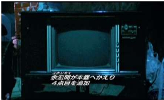
Figure 56 Hallucinated image of Ah-liong's past glory TS (1985)

America may have always been a power symbol in Yang's films, but it does not solve the existential crisis facing Ah-liong. As Ah-liong asserts, America is not the penicillin to the irreparable differences between him (and the past by-gone patriarchal values he represents) and Ah-tsing (the modern Taipei story she signifies), nor is marriage. His death does not seem to deprive the city of anything. On the contrary, it liberates Ah-tsing further from the burden of traditional family-oriented ethics. At the end of the film, Yang inserts the scene of Ah-liong's body being taken from the roadside where he was stabbed into Ah-tsing's conversation with her ex-boss, Miss Mei. While Ah-liong loses his life in a meaningless way, Ah-tsing gets a new job opportunity in the information technology company started up by Miss Mei. Ah-liong's death therefore signals the death of the Confucius traditional code of honour and the dated Japanese tragic hero masculine ideal image. The traditional masculine identity in the rapidly modernising Taiwan is in a way similar to the hallucinated image of his victorious return from the teenage world championship framed by the empty screen of the abandoned TV (Fig 56), which is dumped among a heap of scrap.