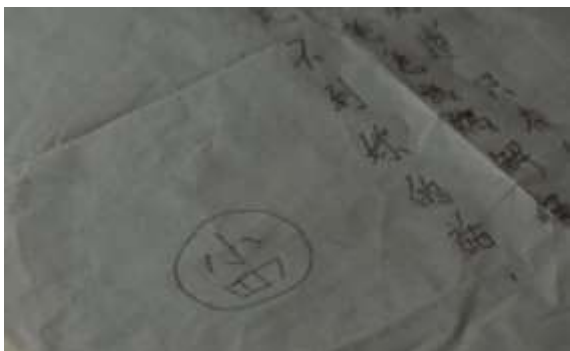
Figure 85 Si'er's signature ABSD (1991)

Unlike other gang members in the film, however, Si'er does not possess a clear identity as a gangster. Honey and the local Wanhua (萬華) gang do not know his name; the head officer of the Juvenile Division has not seen him before, mistaking his signature as a 'funny face' (Fig 85) after he is arrested. Indeed, he is a marginalised character with only an ambiguous identity even within the gangster world that he joined to assert his identity. This sense of disillusionment and ambiguity is also illustrated in his living environment, with a strong sense of entrapment and frustration highlighted by Yang's frames-within-frames devices. The Japanese-style housing in which his family live is in the first place a symbol of these mainlanders' displaced and confused identity. As Si'er's mother notes with a hint of sarcasm, having fought the Japanese for eight years, they now live in Japanese houses and listen to Japanese songs.