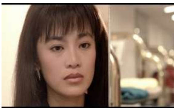
Figure 124 Jia-li's uncertain identity manifested in the confusing virtual and actual images TDOTB (1983)

Yang does not employ many specular shots to help reflect masculinities. In Taipei Story (1984), there is only one mirror shot which tells of Ah -liong's bruised masculinity. In an attempt to preserve his masculine image, Ah-liong has exhausted his means. He tries to uphold traditional