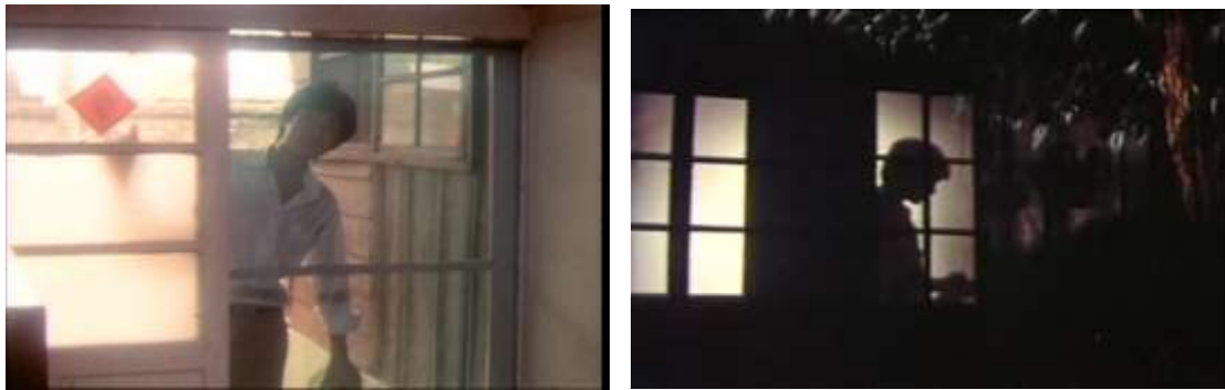
Figures 37 & 38 Blurred image and silhouette of a male figure depicting voiceless masculinity Expectations (1982)

In the next two films directed by Yang, That Day on the Beach and Taipei Story , the diminishing postcolonial patriarchal influence on masculinity formation in Taiwan still lingers, though the patriarchal figure either exerts a debilitating influence on masculinity formation or is obsolete and fails to catch up with the fast-changing pace of liquid modernity. Three decades of rapid economic growth from the 1960s to the 1980s transformed Taiwan from an agricultural to an industrial society, and then from a manufacturing-based to a high-tech economy. Economic development contributed to the political democratisation of the island state, leading to the lifting of the four-decade-long curfew in 1987 (Lu 2011: 766). Irrespective of the different ways Taiwanese men benefited from the political and economic progress, Yang's frames accentuate the frustration and pressures imposed on men due to the loss of signposting (e.g. the breakdown in traditional values) and the failure to catch up with the ever-changing parameters and demands brought in by globalisation and the transition into liquid modernity. It is also interesting to note that the weakening patriarchal influence represented in these films in some ways resonates with the representation of impotent masculinity in early Taiwanese cinema, and the narrative of tragic hero masculine image in pre-war Japanese cinema.