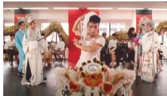
Figure 13 Birdy's pretentious postmodernist art ACC (1994)

By constructing Birdy's living space as a 'postmodernist' studio, Yang intends to use it as a microcosm of Taipei's postmodern space, manifesting all the cultural, economic and political problems faced by Taiwanese people at the time. In the early 1990s in the last century, Taiwan had become a highly urbanised country and most people lived in the city. Economically Taiwan heavily relied on international trade and militarily Taiwan mainly relied on the U.S. for arms purchases and hopefully some form of protection from China's aggression (Tung 2008: 246). As the world became more international, Westernisation seemed to be inevitable. The speed of the modernisation process, however, brought about a radical break from the past of local people