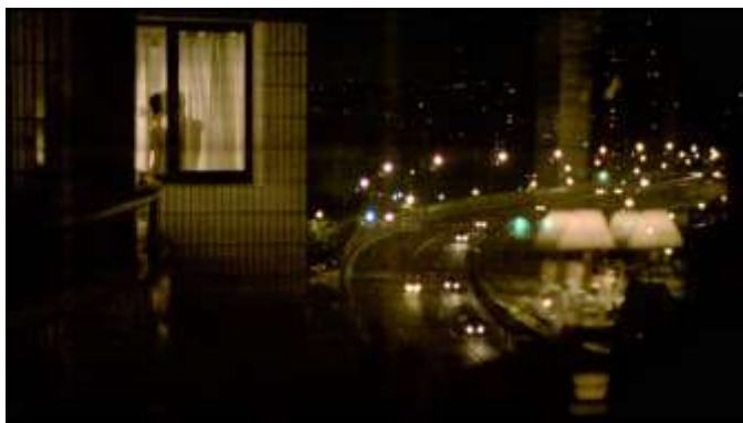
Figure 138 Glass reflection superimposing public and private life Yi Yi (2000)

Such pressure is, like Yang's glass reflections, omnipresent in NJ's living and working space, the two major environments where he defines his familial and transnational business masculinity. In both milieus, NJ's masculinity faces unprecedented challenges brought by late modernity. As shown in Min-min's breakdown scene in her bedroom, the exterior city-night traffic is shot through the bedroom window (Fig 138). Here the reflexivity and transparency of Yang's glass amply convinces the spectators that the inhabitants of the Taipei City in late modernity are actually living in the same 'condominium of the lonely crowd without optimal escape routes' (Ibid: 201). The miniature window-framed scenes simultaneously display different family problems (the argument in the bedroom of Lily's mother, the sobbing in Min-min's bedroom) with the backdrop of the dissolving city lights which intrude into the city dwellers' private lives through the interface of the glass window. In this way, Yang shows the interconnectivity between the dynamism and mobility of the city and the detached human relationships in fragmented families.