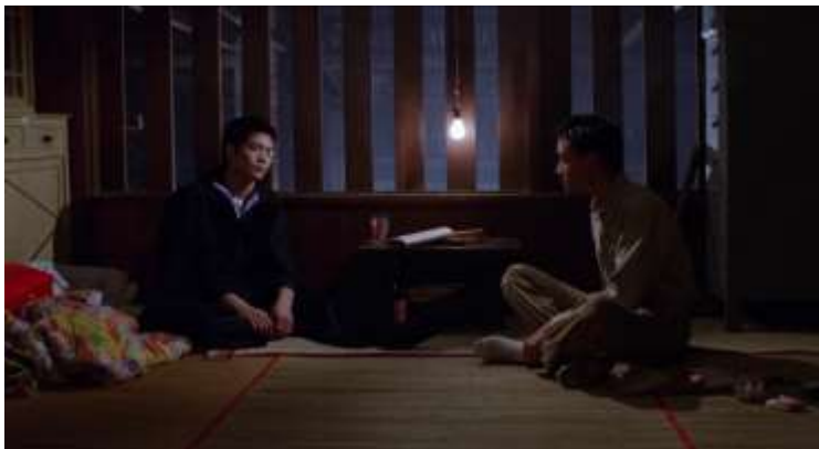
Figure 149 Figurative reflection of Si'er and Honey foregrounds their struggle for a clear identity ABSD (1991)

Another prominent reflection character employed by Yang is Honey, who is a figurative reflection of Si'er (Fig 149). In the first place, both characters represent the marginalised second-generation mainlanders. As explained in the film's first and only title card, these young people are living in the uneasy atmosphere created by their parents' own uncertainties. While a lot of them use American rock culture as a venting outlet for their disappointment and anguish, both Honey and Si'er resort to gangster masculinity in order to establish a stable identity and consolidate their sense of security, and both hold on to the same woman to define their hegemonic power as the possessor of the object of desire. Further, they are the only gangsters who contain both wen (cultural attainment) and wu (physical prowess) attributes of the ideal Chinese masculine identity proposed by Kam Louie (2014: 18). While Si'er strives hard for better academic results in order to go back to day school before his violent act, Honey is a gangster who reads War and Peace . Most importantly, Honey is also a patriarchal figure to Si'er, and in many ways he sees the latter as his successor. Unfortunately, this figurative patriarchal lineage foretells the succession of violence within and across different generations.