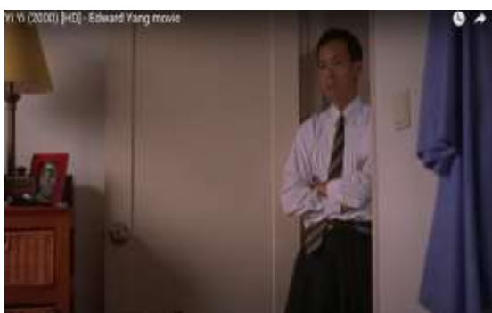
Figure 118 NJ framed by the doorway Yi Yi (2000)