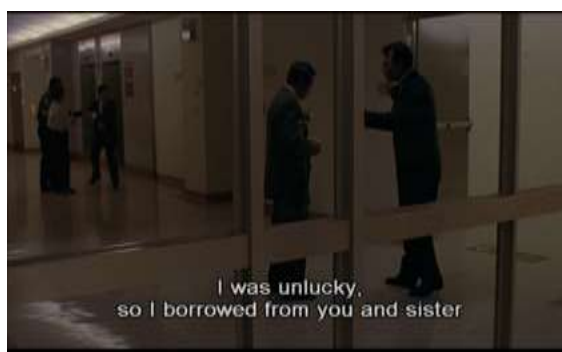
Figure 108 Upside-down photo, subversion of traditions Yi Yi (2000) Figure 109 NJ & Ah-di in separated frames Yi Yi (2000)