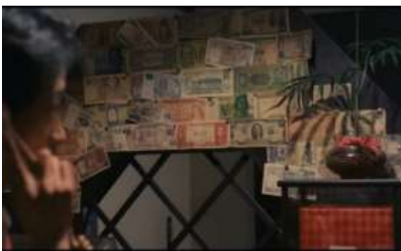
Figure 54 Ah-liong's frustration in urban space TS (1985) Figure 55 International currencies symbolising globalisation

For example, when Ah-liong is in open spaces, he is framed through a mesh of wire (Fig 52) or the car windscreen (Fig 53). Using an ocean of automobiles and people, Yang frames Ah-liong in the busy urban space (Fig 54), accentuating his sense of entrapment within the hustle and bustle of Taipei City. The tight and restrictive framing devices indicate the claustrophobic psyche of Ah-liong even when he is shown in open spaces. The way he is out of sync with this modern society is shown in the scene where he meets Ah-tsing's city yuppie friends. In the first place, the bar where Ah-tsing's friends socialise is a symbol of Westernisation and globalisation. Bank notes from different countries are pinned up to emphasise this fact (Fig 55). Disco music plays loudly in the background and the darts games emphasise the heavy presence of Western culture, which is a sharp contrast to the old-fashioned karaoke bar where Ah-liong normally goes, where its regular customers still sing Japanese oldies.