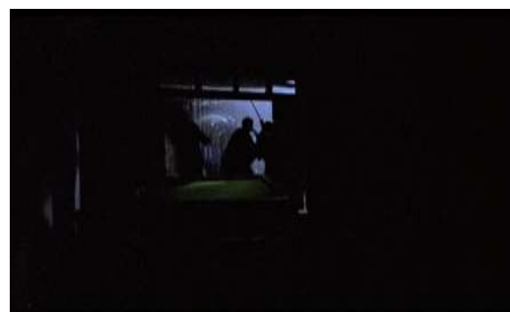
Figure 83 Murder framed in the dark ABSD (1991)