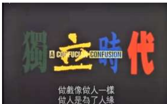
Figure 91 Chinese film title of ACC (1994)

The important theme of independence is also illustrated in the design of the Chinese title of the film (Fig 91). Yang uses four Chinese words in different colours and shapes to represent different political views of Taiwanese people at the time (with the colour green standing for Democratic Progressive Party, and the Chinese word ‘獨’ meaning independent). The special design of the film title also shows that social relationships are to be reassessed in an era where people have started to respond reflexively to their social circumstances in the light of changing information. As discussed before, though both men and women face unprecedented pressure as reflexive beings, men seem to be hit harder due to their vested interest in a patriarchal structure, now being challenged by the onset of modernity. The Confucian tradition which stresses conformism, discipline and personal sacrifice (especially from women) has been one of the fundamental values promoted by the Nationalist government to maintain social harmony and optimise productivity for decades. During the era of modernity, the revision of convention is radicalised in all aspects of human life (Giddens 1990: 19), and men must fight hard in order to defend their status if they cannot adapt to greater gender equality in this brave new world.