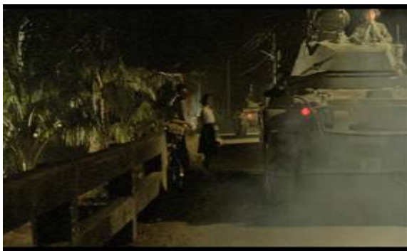
Figure 80 Militarised and oppressive social milieu ABSD (1991)

surviving in that environment. Together with the use of frames-within-frames in these long shots, the recurring theme of violence in ABSD is effectively conveyed. For example, the bloody fights between the two gangs are framed from a long distance at school (Fig 81) and on the street. The confrontation among the gang members is shot from afar and framed by the trees (Fig 82); the entrance of the long and dark pool hall frames the brutal killings triggered by Honey's death (Fig 83). Finally, at the ice cream parlour where the gangs hang out, Yang uses the service area as a frame-within-frame device to showcase the frantic flight of the gang members for their lives (Fig 84). In all the above scenes, Yang's camera sits calmly at a distance from the combustion, and his frames-within-frames highlight one of the most prominent factors defining these young gangsters' masculinity: violence.