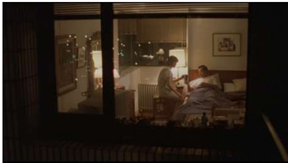
Figure 20 Characters shot from the opposite side of a window Yi Yi (2000)

First, as Tweedie argues, the constant invasion of the public into the private urban space is a way the TNC challenged the notion of ownership and control of housing during the 1980s and 1990s in Taiwan (2013: 189). In Lefebvre's terms, the conceived space of privatised housing was prioritised over the preservation of the monumental construction and collective history of Taiwan. In addition, the omnipresent glass walls and windows which function as a permeable demarcation between the public space and the private space have another layer of meaning in Yang's representation of masculinity in Taiwan during its process of modernisation. While women are certainly not completely excluded from the public world, they are more associated with the private space whereas men are seen to have more legitimate positions in both the public and private realms. Some feminist theorists have argued that the concept of the individual in the public domain is imbued with characteristics that, as part of binary formulations, are deemed inherently masculine, such as rationality, while the individual of the