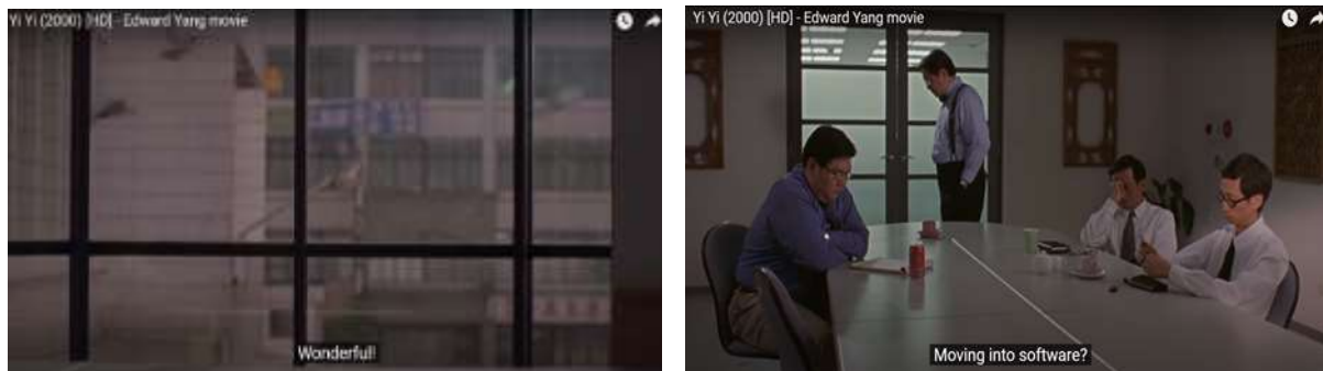
Figure 112 The panelled window: another cage motif Yi Yi (2000) Figure 113 The gridded door entrapping Da-da Yi Yi (2000)

entrepreneurs are in a way experiencing the same existential crisis as Xiao-ke, the architect in Taipei Story (1985), who increasingly loses a sense of certainty and predictability amidst the rapid changes in late modernity. This kind of uncertainty and anxiety accentuated by Yang's recurring grid and cage motifs in NJ's workplace unfortunately is also part and parcel of hegemonic transnational business masculinity.