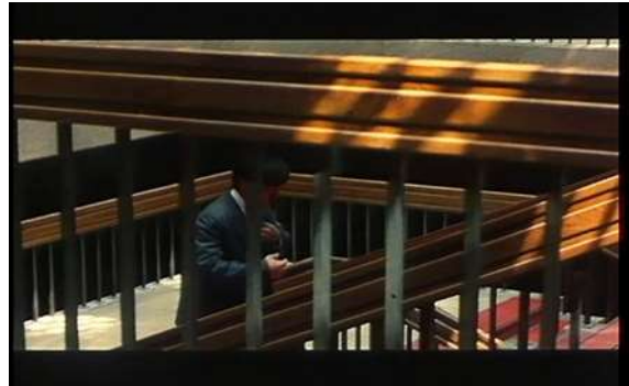
Figure 62 Office building like a pile of boxes Terrorizers (1986) Figure 63 Stair railings suggest entrapment Terrorizers(1986)