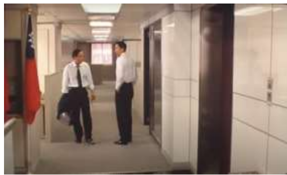
Figure 96 Corridor as grid motif ACC (1994)