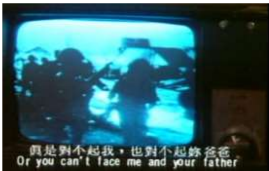
Figure 36 Usual way of asserting masculinity: war

With the absence of a male figure, the actual power asserter is the one who holds economic power – the widowed mother. Over dinner, she sends out an ultimatum to her elder daughter: if she cannot secure an offer of a university place this time, she must find a job and support the family. Here we see the traditional idea of masculinity, no matter whether it is manifested in a male or female character, embodied in the virtues of ‘ churen toudi ’ (出人頭地 being outstanding) and ‘ Dandang ’ (擔當 being responsible for the family) (Wong & Yau 2016: 223). The economic power held by the mother and the expectation placed on the elder daughter to achieve academic (and future economic) success is not represented by Yang as a symbol of feminist progress though. Rather, as stated by Yang in an interview, it is a more nuanced perspective to describe the changing social conditions and the pressure imposed on both males and females (cited in Berry 2005: 288).