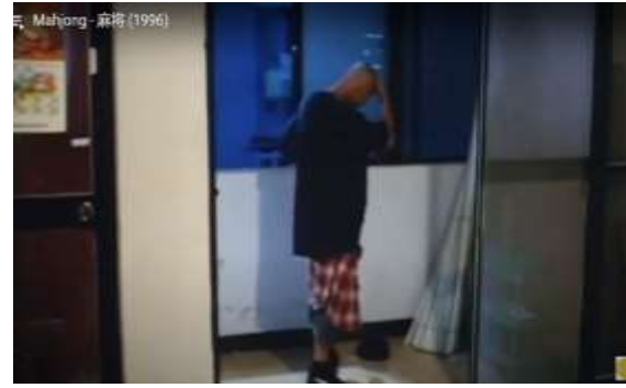
Figure 104 Crumbling masculinity framed by door MJ (1996) Figure 105 Frustrated man in two sets of frames MJ (1996)