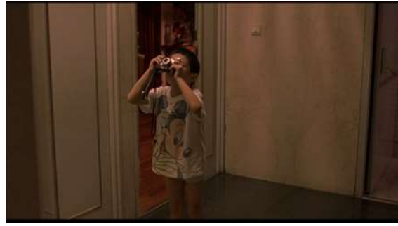
Figure 153 & Figure 154 NJ reflecting on the present while Yang Yang exploring the future Yi Yi (2000)

In a way, Yang Yang constitutes a figurative reflection of the little boy Xiao-hua in Expectations , the second short in the seminal TNC film In Our Time (1982). Xiao-hua's confusion about where he can go after grasping the skills of riding a bike in a way symbolises Taiwanese men's struggles in defining a clear masculine identity in the context of conflicting political-economic status and the rapidly modernising society. In this regard, the last character in Yang's film seems to be answering the first young male protagonist's questions about what to do, where to go and how to act. It is important to note that Yang is by no means trying to engender the possibility of providing an overarching truth that will resolve the various levels of angst experienced by men in their identity construction, nor is he resigned to the impossibility of functioning within the repressive logic of those conditions of alienation, fragmentation or angst (Jacobson 2002: 64). Instead, Edward Yang and his junior alter ego Yang Yang show that although they may not have any grand narratives of truth in defining their own identities, they do have a clear direction to go against the tide of liquid modernity.