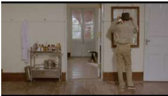
Figure 132 Si'er's misidentification with the empowering cowboy masculinity ABSD (1991)

army trucks in the film is a constant reminder of imminent war threats from mainland China. The teenagers who grew up in such an oppressive and violent environment in the early 1960s lacked a sense of security. Many of the objects which keep recurring in the film, for example the torch, the Elvis songs, the samurai sword, the old radio and cassette player, all come from elsewhere and are central to the existential crisis undergone by the characters in the film who have to grab a sense of self whenever they can find it (Rosenbaum1997: 6). Yang uses one mirror shot to epitomise the model of masculine identity which is grabbed by the protagonist Si'er (Fig 132).