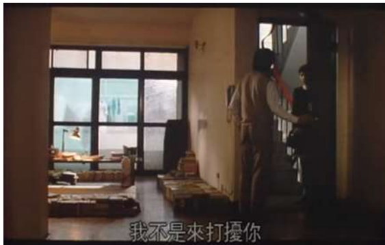
Figure 98 Glass panels as grid motif ACC (1994)