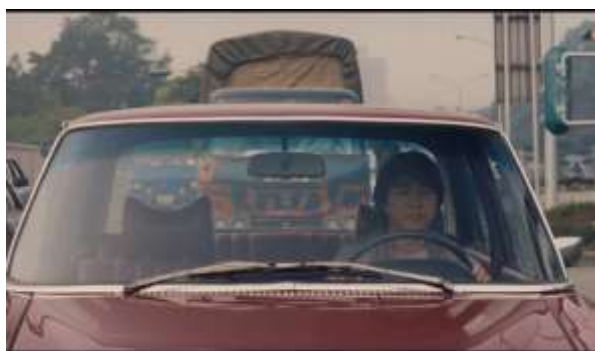
Figure 52 & Figure 53 Frames-within-frames accentuating Ah-liong's sense of entrapment in urban space TS (1985)