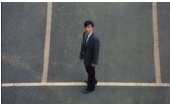
Figure 66 Parking Bay as a frame-within-frame device Terrorizers (1986)

To exacerbate the situation, Li's home does not act as a relaxing shelter for him either. In two different shots near the beginning and the middle of the film, Li appears almost exactly in the