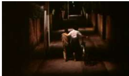
Figure 25 Tunnel vision showing disillusionment Expectations (1982)

This is Yang’s view about masculinity in a time when everything seemed hopeful and bright, a time when Taiwan was on the brink of seeing the lifting of martial law. Freedom, however, comes at a price. Without the certainty of an authoritative figure laying down the rules, while at the same time facing the unprecedented challenges brought about by the rapid transition into modernity, the individual must take responsibility for all actions and choices. Although Expectations is not part of the First Taipei Trilogy as it is not a full-length feature film, it is important in Yang’s oeuvre as it marks the beginning of Yang’s examination of men’s