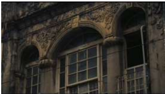
Figure 3 The baroque-style colonial buildings TS (1985)

and filial and helps the father of his fiancée, Ah-tsing (阿貞), to repay his debts; he helps his childhood friend sort out his family and financial problems, and he tries to protect Ah-tsing from her young stalker. Yet, in the obsolete living space which is bracing for its looming demolition and regeneration, Ah-liong seems powerless or heavily burdened. Sitting idle in the rundown fabric shop, he gives out blank promises of taking his staff to Disneyland as he is going to expand his business in America (Fig 4).