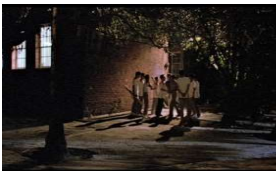
Figure 82 Gang violence framed by trees ABSD (1991)