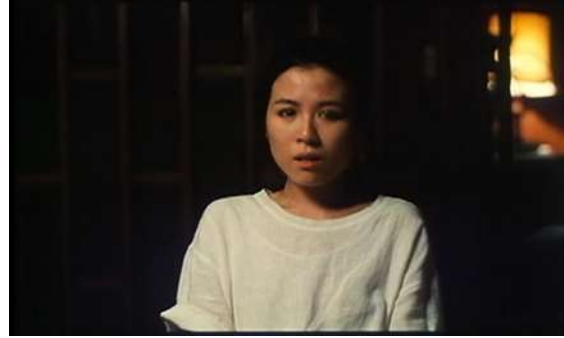
Figure 10 Zhou staring into the camera Terrorizers (1986)