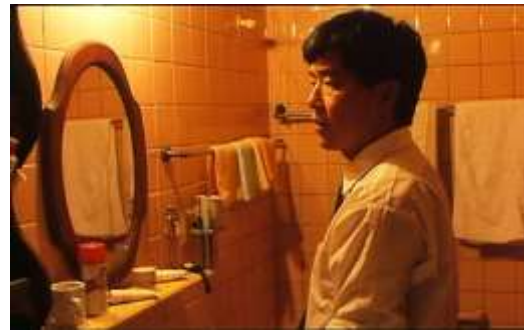
Figure 127 Li's reflection deliberately not shown Terrorizers (1986)

The two male protagonists start to seriously reflect on their own identity when they start to confront themselves through their mirror (figurative or literal) reflections. After moving into his rented flat and turning it into a darkroom, Xiao-qiang sets up a collage of White Chick on one of the walls (Fig 128). In a way, this wall acts as a cinema screen, which is likened by Metz to a mirror, with Xiao-qiang's desire projected on it in ways that are accessible to his male gaze. While he does not directly identify with the image of White Chick, he identifies with the perception that he is the creator and sole bearer of this image, which gives him a sense of empowerment about his masculine identity. Contrary to Laura Mulvey's (1986: 203) claim about the active/male and passive/female split in the pleasure of looking from the male's perspective, however, the White Chick constantly resists and evades any form of containment.