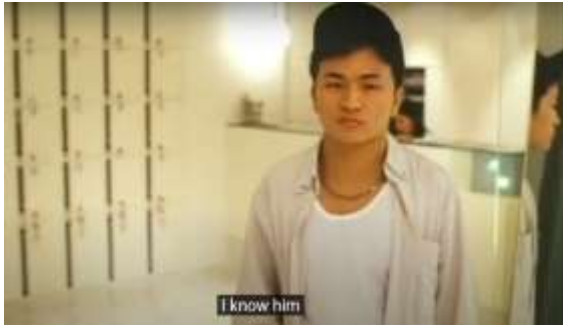
Figure 134 Hongyu's fragmented mirror reflection MJ (1996)