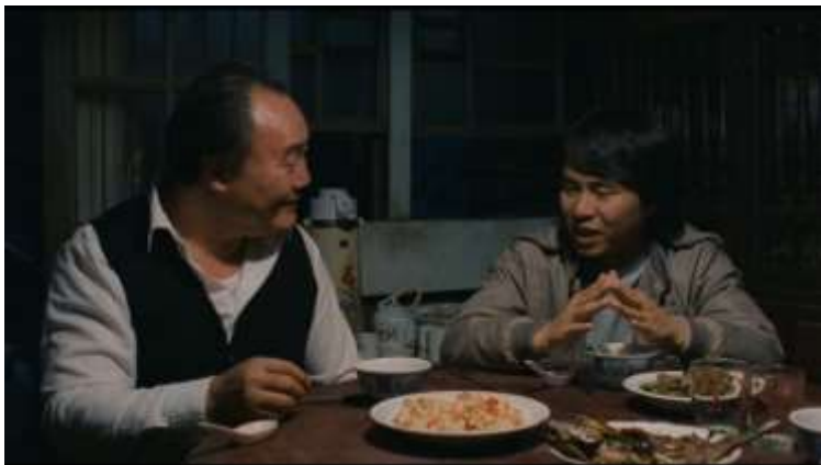
Figure 144 Ah-liong and Ah-tsing's father are mirror images of each other TS (1985)

who live in the rapidly modernising city in search of their past glory and idiosyncratic codes of honour. According to Ah-tsing's observation, Ah-liong and her father are complete mirror images of each other (Fig 144). Ah-liong values traditional family ties. He uses the money to move to America to help repay the debt of Ah-tsing's father. He drags the wife of his childhood friend from the gambling table back home to take care of her children, showing his friend that a man should be able to control his wife in order to maintain the patriarchal order. He is nostalgic about his past and seems unable to cope with the new norms in a changed, and changing, world. As his ex-girlfriend remarks, 'The whole world has changed, only you remain the same'. He fights to retain the status of provider, protector, and saviour of family values. He is the product of a bygone traditional culture and patriarchal hierarchy, struggling to relive, or cling to, his past glories.